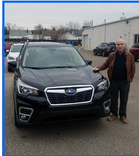
My first new car in 20 years! Where to put the rig?

Go to www.qcwa.org/qso-party.htm for complete information. Let's make Chapter 1 competitive this March!